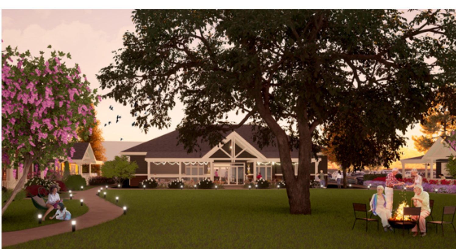
This is the view of the green and the Common House.